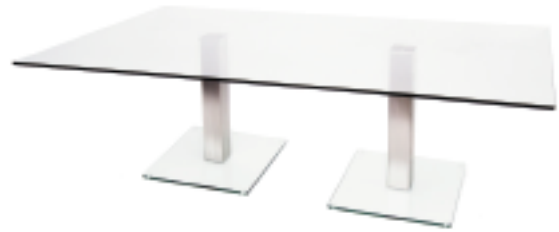
1500 mm x 900 mm top with legs finished to stainless steel