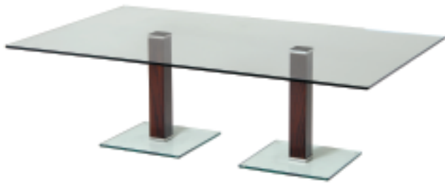
1500 mm x 900 mm top with legs finished to walnut